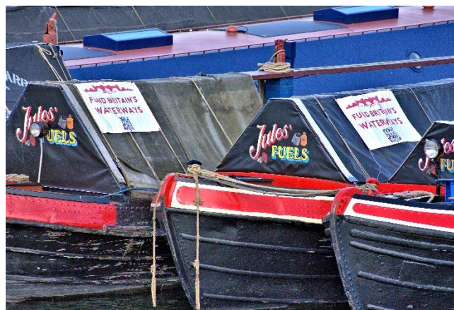
Boats with FBW banners