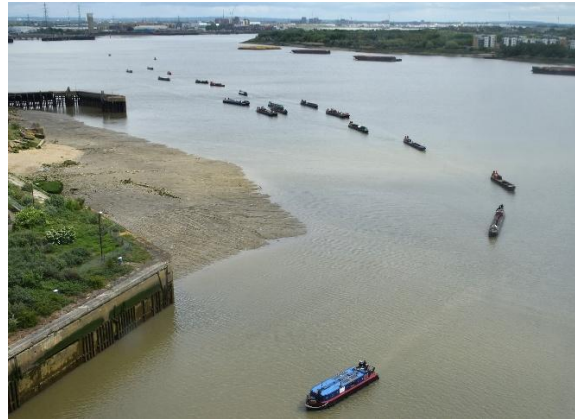
Boats turning into King George V Lock