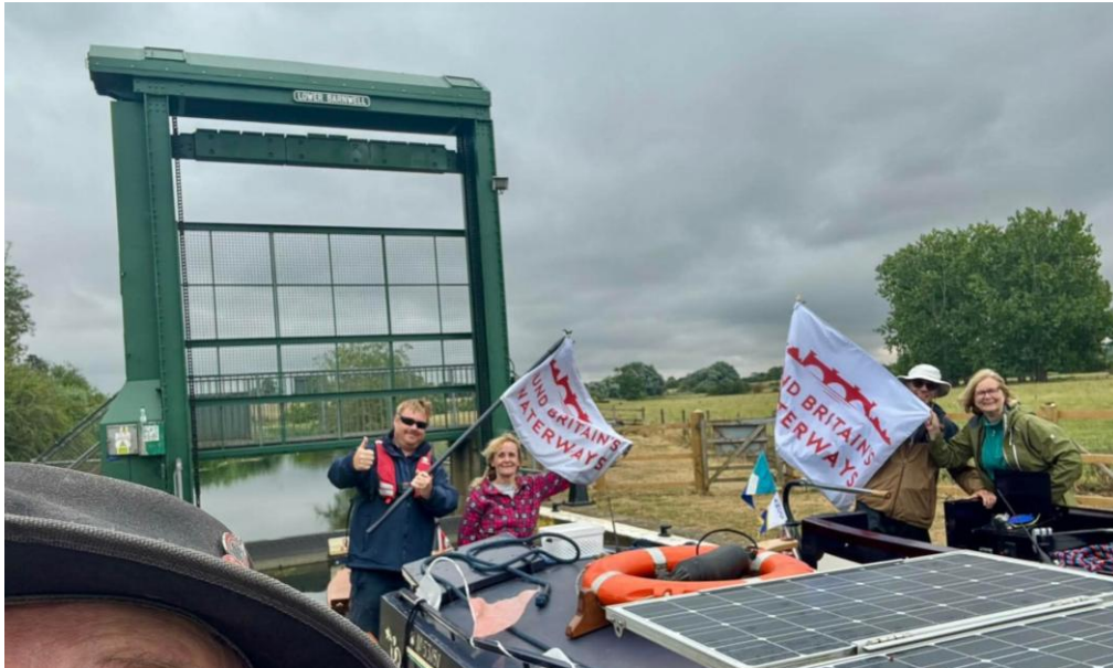
Campaigners on the River Nene

As the boats progress across the country they will be visiting boat clubs and events along the way to help spread the word. The schedule is set out below. Please do go along and meet the campaigners if you can – they will be delighted to see you.