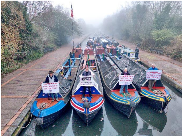
Flotilla at Moorcroft Junction