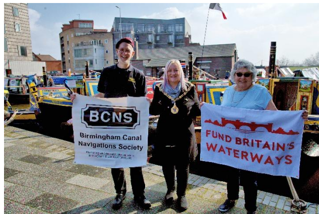
BCNS and FBW Chairs with the Mayor of Walsall