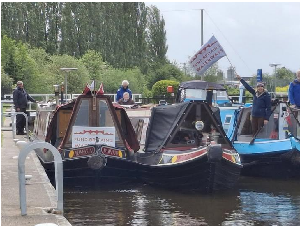
Setting off from Strawberry Island Boat Club, 12 May 2026

After protracted planning caused by various stoppages around the country, the route of the main campaign cruise for this year is decided. The first group left Strawberry Island Boat Club in Doncaster on 12 th May and will meet up along the route to Ellesmere Port with other groups from Ashby and Birmingham and other starting points. Here the flotilla will gather in late June at the National Waterways Museum, which is celebrating its 50 th anniversary, before crossing the tidal Mersey to Liverpool Docks.