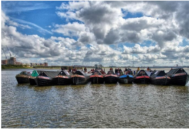
Waiting for the Tide